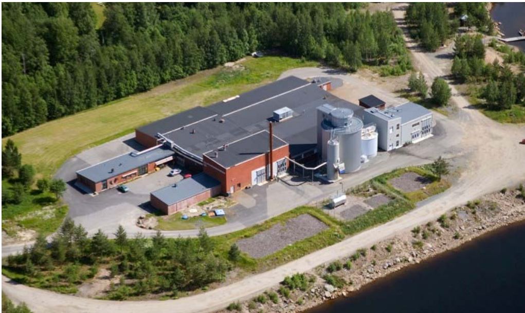
Figure 1 The biogas plant at Svedjan, Boden

Facts/unique: thermophilic (55°C) co-digestion of sewage sludge and food wastes. First in Sweden to deal with methane leaks during upgrading.