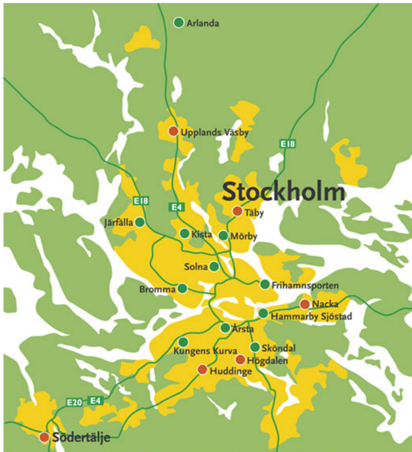
Figure 3 Map of existing (green dots) and planned (red dots) filling stations in Stockholm (March 2008).

Aga Gas has built a depot for LNG in Knivsta. The depot acts as a reserve in case the biogas runs out. The gas is distributed to filling stations in containers. Aga Gas is also planning to establish an LNG plant in Nynäshamn together with Nynäs Refinery.