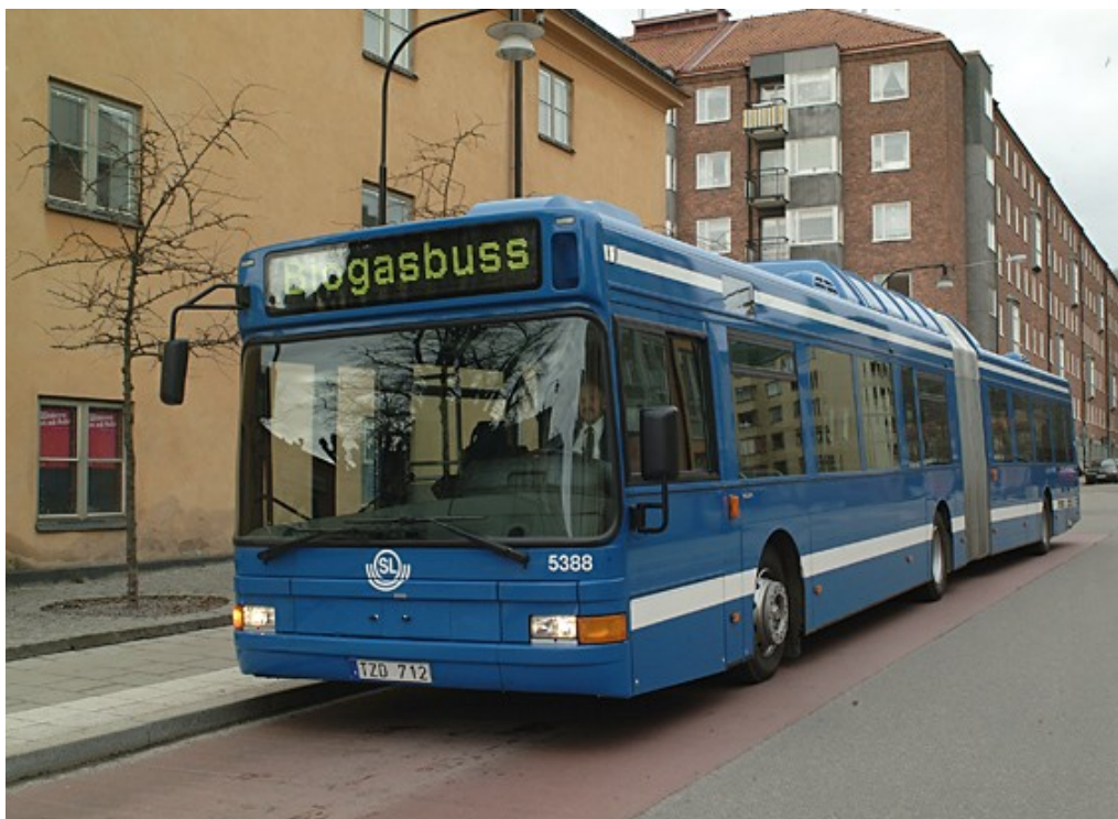
Figure 1 Biogas bus in Stockholm

Facts/unique: Ambitious development plans to increase biogas production and distribution. Upgrading of biogas at one of the world's largest underground sewage treatment plants.