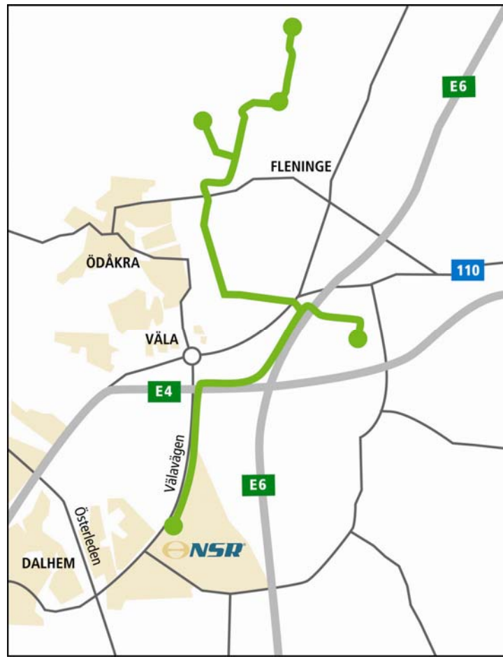
Figure 4.2.3 Map of the bio-manure pipeline