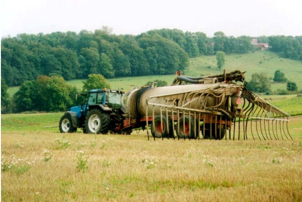
Figure 1 Hose spreader for spreading liquid manure, Helsingborg

Facts/unique: Biogas to the gas grid and piped bio-manure. Initiator of the bio-manure certification system.